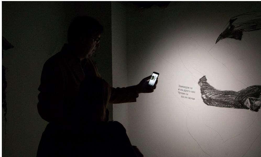
Momentum by Predrag Terzić