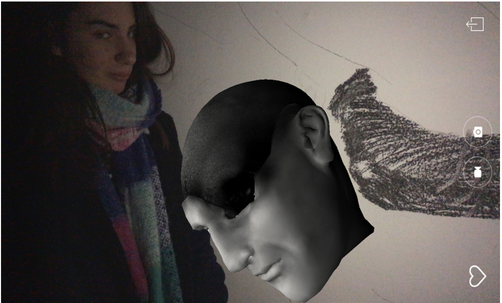
Momentum by Predrag Terzić