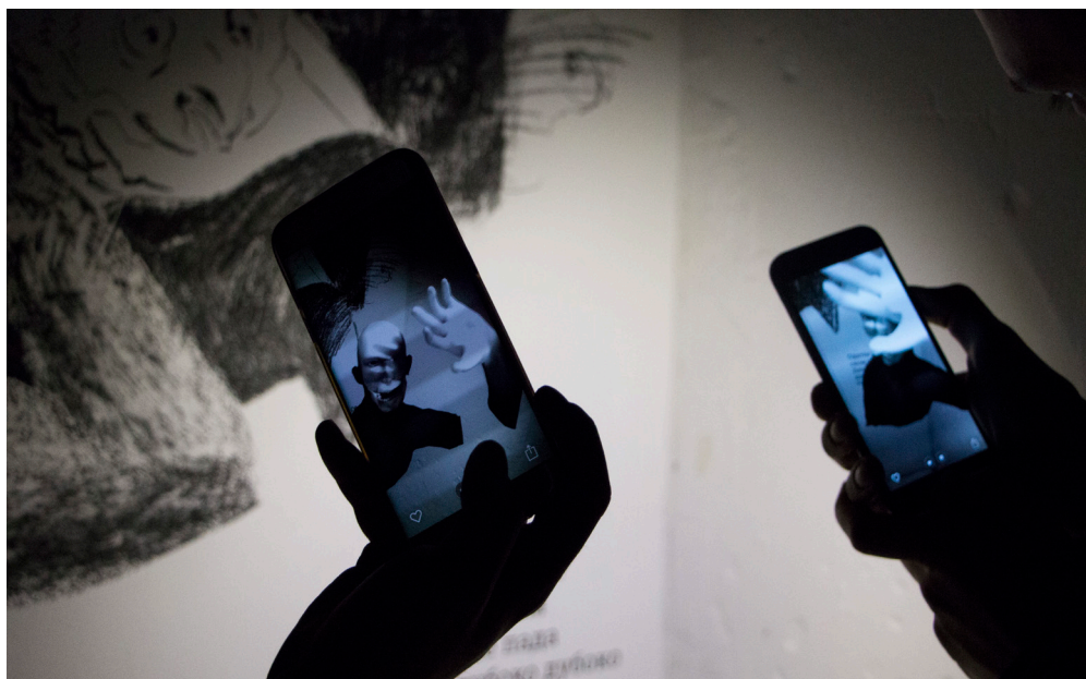
Momentum by Predrag Terzić