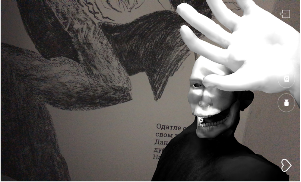
Momentum by Predrag Terzić