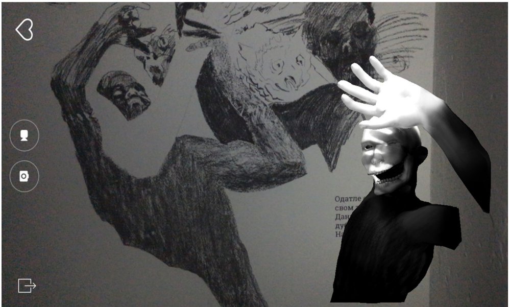
Momentum by Predrag Terzić