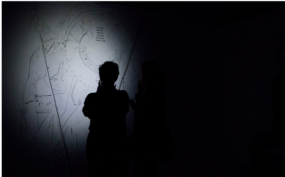
Momentum by Predrag Terzić