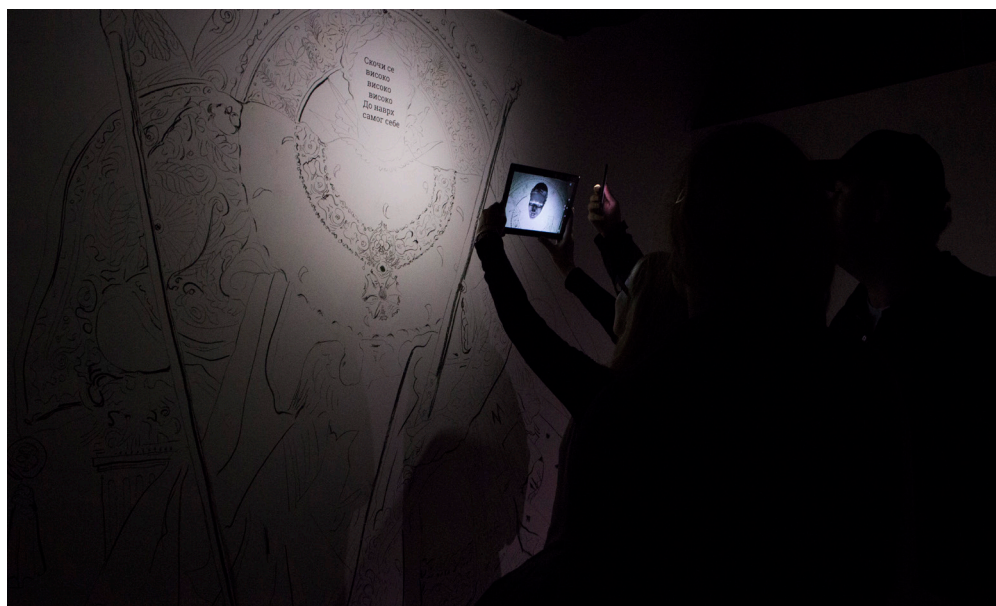
Momentum by Predrag Terzić