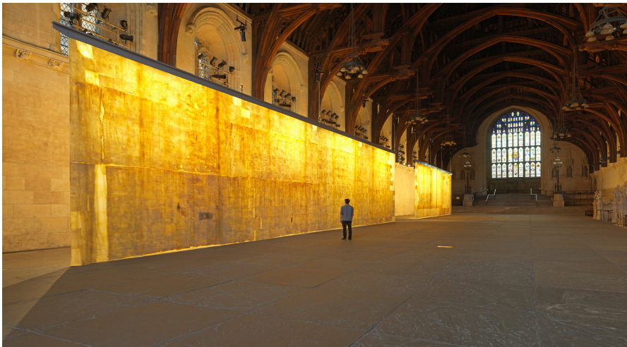
Fig. 7: Jorge Otero-Pailos, The Ethics of Dust , Palace of Westminster, London, 2016.

Such an atmospheric architecture is currently being explored and practiced by architect and preservationist Jorge Otero-Pailos, who created series of installations, based on the idea that pollution, grime and dust are part of the cultural heritage. (Fig. 7) The name of his project “The Ethics of Dust” responds directly to John Ruskin’s book, composed by series of lectures, from 1867. 37 Based on the notion that materials are constantly changing, Otero Pailos’s project deals with the removal of dust and the pollution of the walls of historical buildings by using latex cleaning technique, where liquid latex is painted on the wall. As it dries, it lifts away taking the microscopic dirt and dust and leaving a clean and carefully preserved wall behind.