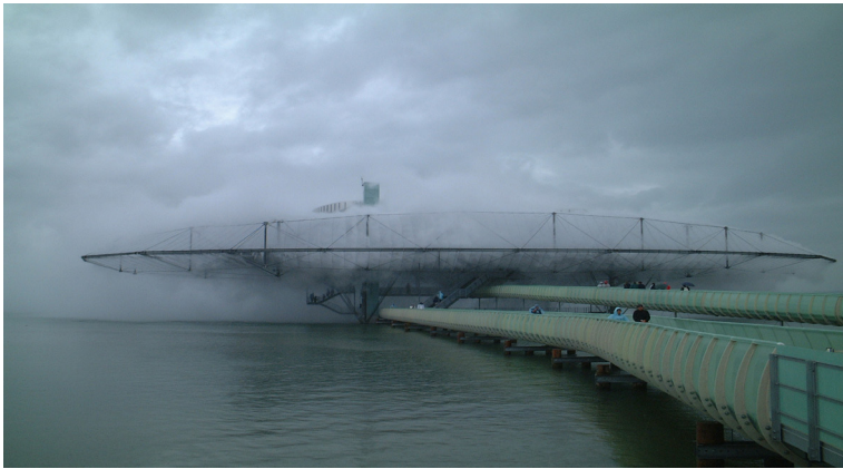
Fig. 8: Elizabeth Diller, Ricardo Scofidio, Blur building, Yverdon-les-Bains, Expo 2002.

In his projects “Windtrap” and “Airflux”, Philippe Rahm explores natural properties of the site – air and wind, to sculpt the architecture and develop a relationship between the air and the breather. Paris-based architecture practice R&Sie(n), in never built museum project in Bangkok, explores relationships between facades and polluted city air, suggesting architecture as a breather. Diller Scofidio + Renfro in “Blur building” explore an air architecture , challenge the materiality and permanence of conventional building, using a smart weather system that respond to changing atmospheric conditions. Breathing space is thus not limited to the controlled inner air, it rather creates its state from unpredictable weather which is mixed with the filtered water of lake (Fig. 8).