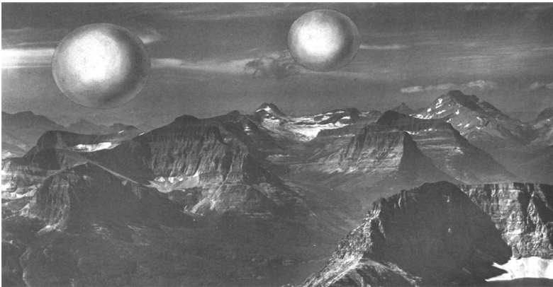
Fig. 1: Buckminster Fuller, Floating Cloud Structures (Cloud Nine), 1960.

The dream of flying, or overcoming gravity, finds its formal appearance most notably in utopian architectural visions, such as Buckminster Fuller and Shoji Sadao "Floating Cloud Structures (Cloud Nine)" from 1960. (Fig. 1) It was a theoretical proposal for an airborne habitat whereby several thousand people would be housed within the space of mile-wide floating spheres. The hypothesis of the project is that if the air within this urban sphere could be climatologically controlled so that its temperature is just one degree higher than the ambient atmosphere, the sphere would levitate, like a giant hot air balloon.