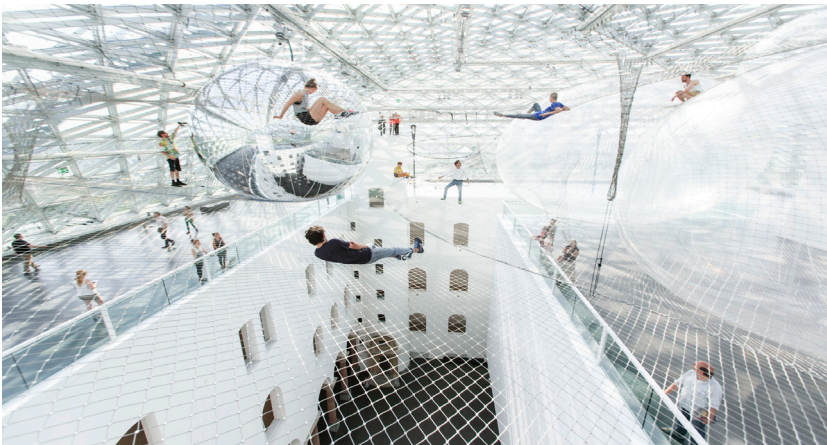
Fig. 4: Tomas Saraceno, In orbit, Kunstsammlung Nordrhein-Westfalen, Düsseldorf, 2016.