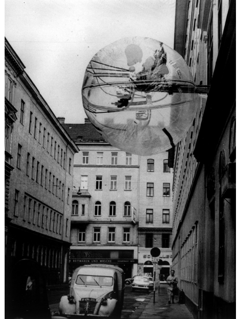
Fig. 3: Haus-Rucker-Co, Balloon for two, 1967.