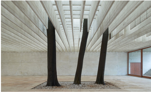
Fig. 5: Sphere Fehn, Nordic pavilion, Venice, 1962.

vacuum filled with the solid, predictable elements, Rahm conceptualised it as a sort of ethereal mass, filled with the immaterial components that stimulate users' reactions. (Fig. 6)