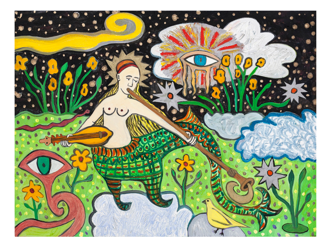
Susan Bee, Siren Song , 2019, 18" x 24", oil and enamel on linen. Collection: Ellen Hackl Fagan.