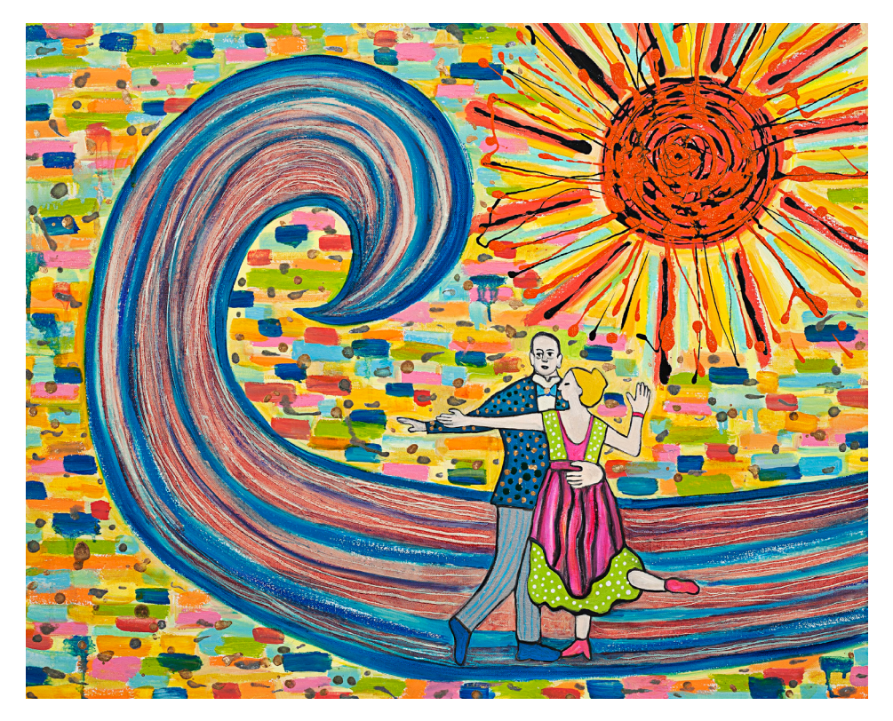
Susan Bee, Tangled Tango, 2018, 24" x 30", oil and enamel on linen.