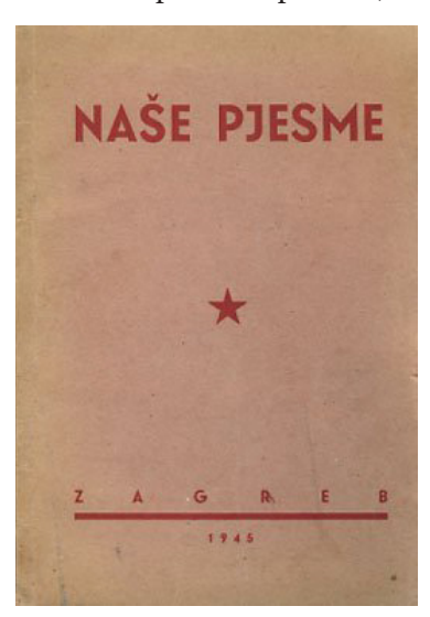
Illustration 1: Naše pjesme , title page of 1945 edition

Importantly, already during the Yugoslav National Liberation War, the production of mass (or partisan) songbooks occurred. Already on 7 November 1941 in Užice, in the liberated territories, a special issue of the journal Borba , titled Antifašističke pesme , was printed with verses of 33 songs, mostly adapted from Soviet models. In the following year a more comprehensive songbook Pesme borbe was issued, followed by the final and perhaps most important songbook, Naše pjesme , printed in 1944 in liberated territories in Lika. Termed as a "partisan collection of poems", "fighting songs" and "songs of the new desires", this songbook brought together songs of all categories: ones based on folk models as well as new composed ones with signed authors, including also pre-war workers' songs. The same songbook had three more issues, firstly in the following year as the war was still being waged, and then again in 1945 and 1946 in the immediate post-war period, thus serving as a bridge connecting the crucible of the National Liberation War with the post-war period (see Illustration 1).